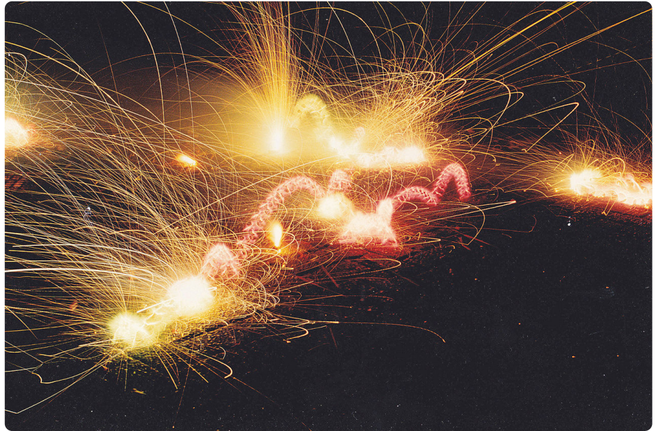
Fireworks in the Netherlands.

Every New Year's Eve, the skies over the Netherlands are lit with spectacular displays of fireworks. While these colorful explosions are a sight to behold, they come at a significant cost. The tradition of allowing ordinary citizens to ignite fireworks between 6 PM on December 31 and 2 AM on January 1 has led to increasing concerns over safety and environmental impact.