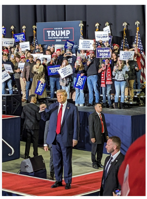
Donald Trump at a rally in Manchester, New Hampshire.

Donald Trump's 2024 presidential campaign, launched on November 15, 2022, has been a whirlwind of promises, controversies, and resilient slogans. From "Save America" to "Make America Great Again," Trump has been relentless in his pursuit to win back the White House. The campaign, marked by intense rallies and fiery speeches, addressed several crises that resonated with his base, including immigration, economic instability, and crime.