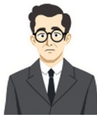
Jean-Paul Sartre, 40

Match with me if you are ready to explore the depths of your potential and redefine your own meaning of life.