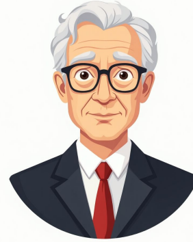
Viktor Frankl, 50

Slogan: „ When we are no longer able to change a situation, we are challenged to change ourselves. “