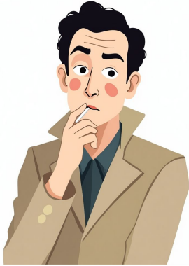
Albert Camus, 37

Slogan: „ The struggle itself towards the heights is enough to fill a man's heart. “