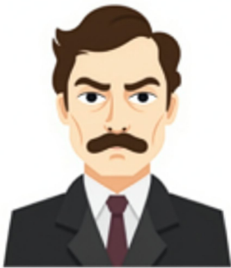
Friedrich Nietzsche, 45

Slogan: „ To live is to suffer, to survive is to find some meaning in the suffering. “